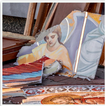
Remains after rocket fire on Odesa in June 2022

When we reviewed our contact lists of families who were enrolled in our programme in February 2022, we discovered that almost 90% no longer live in Odesa or Petrovka. All of