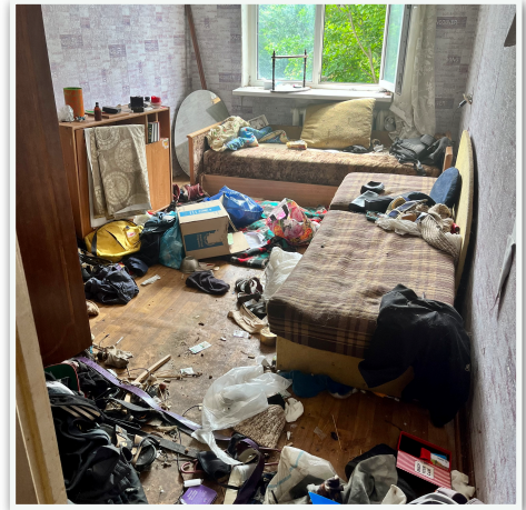
The flat before cleaning

In May 2023, his mother passed away after having suffered for a long time. When we saw the flat where she had lain dead undiscovered for three days, it was clear to us that the relocation to Western Ukraine had also saved the boy's life. He has new parents and it is so good to see that he feels comfortable in his new family, that he is well cared for and accepted. We hope and pray that he, as the only survivor of his family of origin, will take a different path than his ancestors. All the groundwork for this has been laid, thanks be to God. Our association has taken care of the cleaning, disinfection and clearance of the flat as well as the burial of his mother.